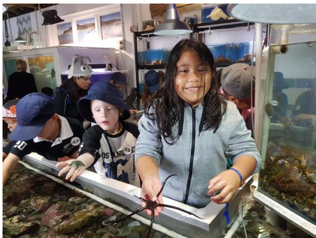
Rata -Marine Education Centre