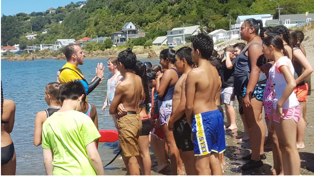
Totara – Life Saving at Worser Bay