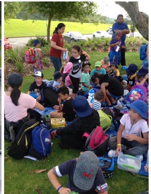
Rata & Rimu - Water play and lunching at Avalon Park.