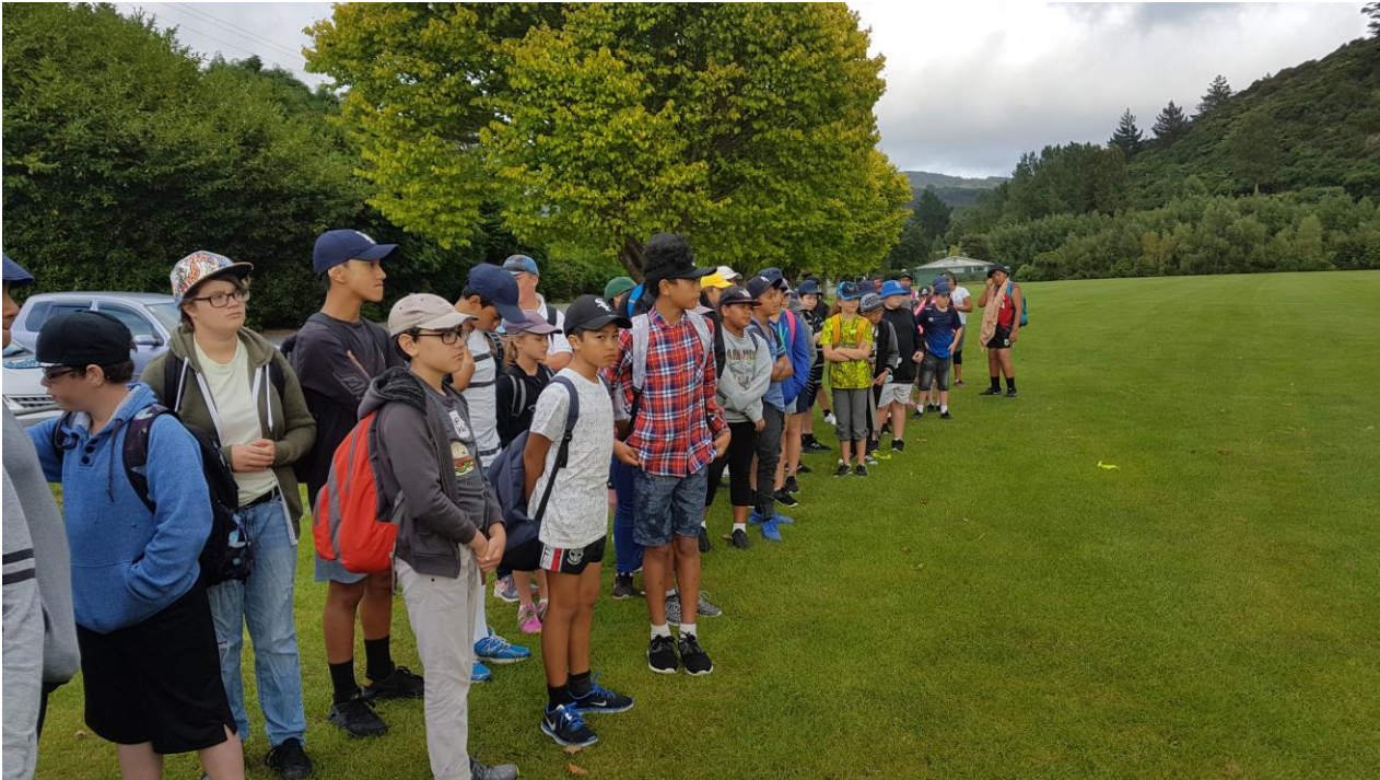
Totara – Richard Prouse Park