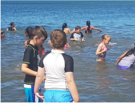
Hinau Petone Beach