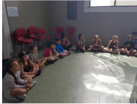
Hinau –Settlers Museum